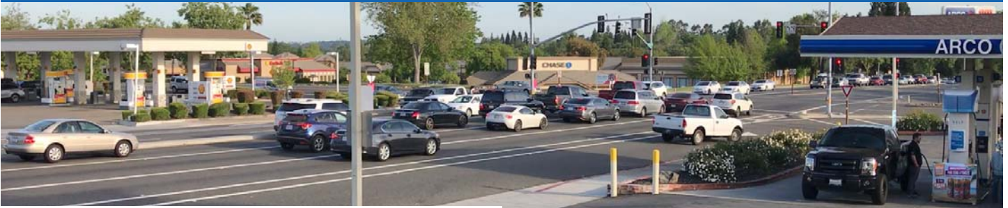
Phase 1, Intersection of Douglas Blvd and AFR >