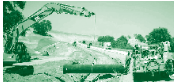
Sierra College Blvd. Water Transmission Main Project