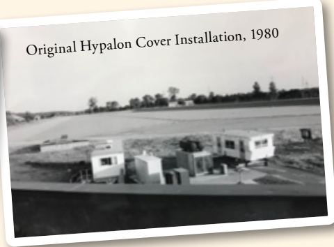
Original Hypalon Cover Installation, 1980