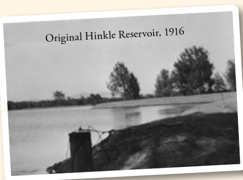
Original Hinkle Reservoir, 1916