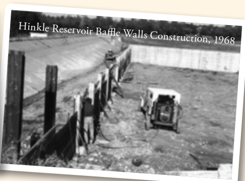
Hinkle Reservoir Baffle Walls Construction, 1968